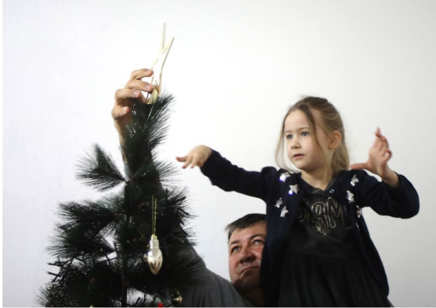
Young Ukrainian refugee dressing the Christmas tree at IN's Joy Centre in Sighisoara, Romania

Thank you for supporting International Needs in prayer – we are grateful for your partnership.